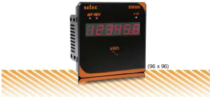
(96 x 96)