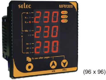
(96 x 96)